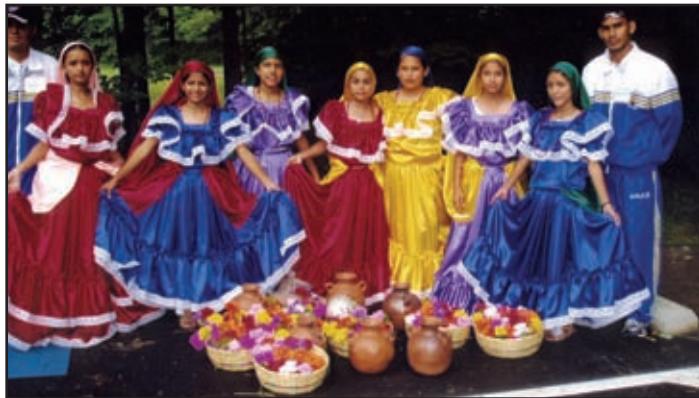
COAR athletes present program of song and dance during trip to Cleveland, Ohio, for 2004 International Children's Games.

Back in Zaragoza, a long-awaited cafeteria was opened in 2004 at COAR, serving hot meals and a variety of hot and cold snacks at reasonable prices to students, employees and visitors. It helped the local economy by employing several workers and strengthening the local supply chain.