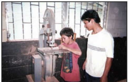
Child with carpentry instructor, c. 1983 Niño con instructor en taller de carpintería, c. 1983

The following workshops were offered at COAR in 1997: carpentry, silk screening, welding, tailoring, sewing, crafts, baking and tortilla making. Each child was invited to choose three areas and then