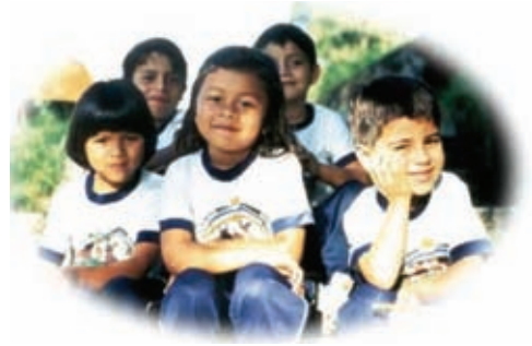
Postcard of COAR children Tarjeta postal de niños y niñas de COAR

“COAR is a great work but also a great responsibility. It’s not enough just to give the children food. You must be dependable and alert to see how things are going and what results are being achieved. The children depend on us. We have to try to give the best of ourselves. We have to be awake every minute, always evaluating, not saying that everything is fine. We need to be aware of how the children are doing in their spiritual growth. I am grateful that the congregation has taken on this work.”