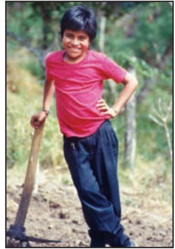
Children worked clearing the land for planting. Los niños hicieron trabajo del campo.

Although Father Ken knew that it would be impossible for COAR to function without some external help, the goal was to be “almost” self-sufficient. In order to generate funds for the daily needs of the children, various vocational training and self-sustaining activities were begun. Six hundred chickens and hens were bought, providing eggs and meat for the children and for sale. Dairy cows produced milk and cheese. In addition to avocado, lemon and orange trees already on the property, 80 more fruit trees were planted, as well as corn, beans, tomatoes, radishes and cabbage. A former chicken coop was converted into a carpentry workshop where simple furniture was made for the new homes.