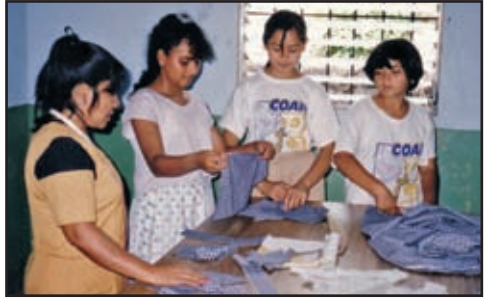
Young women cut cloth in tailoring workshop.