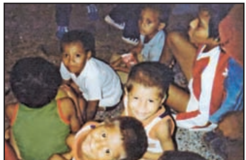
Children at COAR, 1983 Niños de COAR, 1983

A second tract of land measuring 6.9 acres was obtained in March 1982 at a cost of 200,000 Salvadorean colones . The third piece of property, measuring less than an acre, was purchased for 300,000 colones and