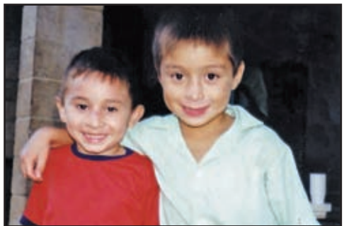
Two boys at COAR, 2003 Niños de COAR, 2003

Preparing for the sisters’ silver jubilee in Central America, a committee in Guatemala wrote “A Brief History of the Sisters of Charity of the Incarnate Word 1963-1988: Twenty-five years of service to the people of God in Guatemala.” The history begins: “On March 19, 1988, a significant event will take place in the city of