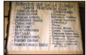
Sign listing medical and dental services available at Santa Teresita Clinic Rótulo con listado de los servicios que ofrece la Clínica Santa Teresita

In 1985 the clinic organized a new program to help rural communities. Thirteen men and women attended an intensive course for a month on