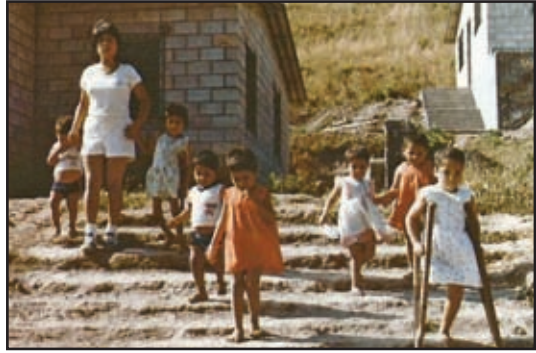
Children walking down steps at COAR, 1983