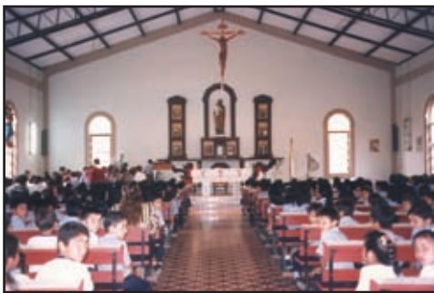
St. Joseph's Chapel at COAR Capilla San José

On March 19, 1990, feast of Saint Joseph, mass was celebrated in St. Joseph's chapel by Archbishop Arturo Rivera y Damas. It was an especially