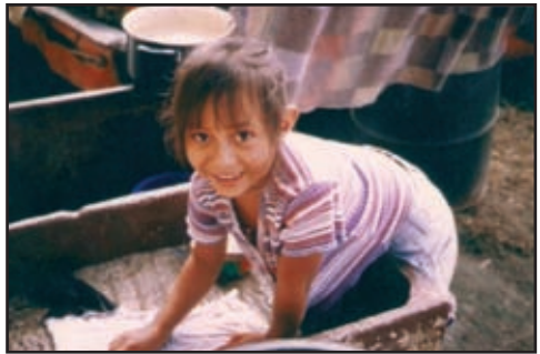
Child washing clothes Niña lavando ropa

Ten girls finished their time at COAR in the year 2000 and went to live at the Divina Providencia home in Santa Tecla run by the Carmelite Missionaries of Santa Teresa. COAR helped the Carmelite sisters raise money for this project. Twenty-nine young men moved on to the Divino Salvador home for youth in Sonzocate. These transitional programs provided lodging and care while the young people entered the job market or continued their studies.