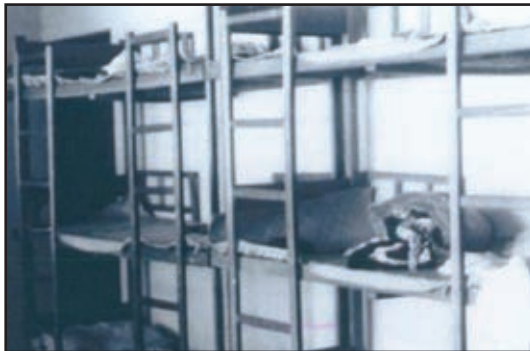
Bunk beds for smallest children in the “big house,” 1983 Camarotes para niños chiquitos en la casona, 1983