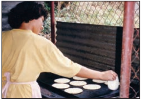
Young woman making tortillas at COAR

Grupo de cuatro señoritas cortando tela en el taller de costurería