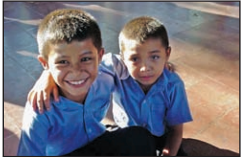
COAR children, 2003 Niños de COAR, 2003

With this step, COAR’s general high school course was extended to include a technical qualification in accounting and a technical qualification in secretarial skills. Local families donated equipment, material and time to the project, making it a “community partnership in progress” ( COAR News , Summer/Fall 2000). The Benefit Luncheon, attended by 155 friends of COAR, raised $26,000 for the construction of the two classrooms and science laboratory.